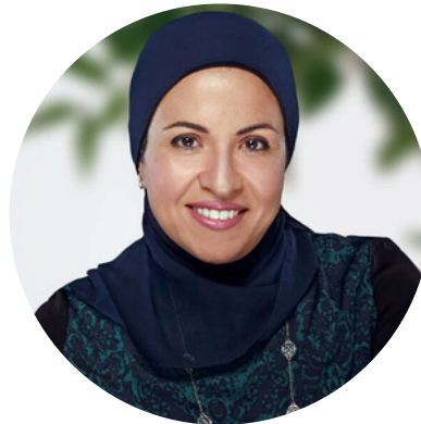
The Optimistic Oncologist

Implementation of dietary and other integrative strategies for the management of cancer: A Consultants perspective