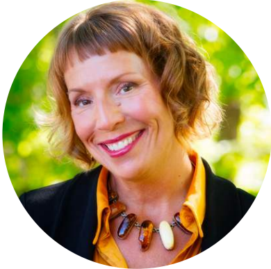
DR. NASHA WINTERS, NATUROPATHIC DOCTOR (ND) & AUTHOR

Online training material on cancer as a modern and metabolic disease, implementing TCR and fasting for cancer treatment, and the tools to understand, manage, and treat your cancer patients holistically